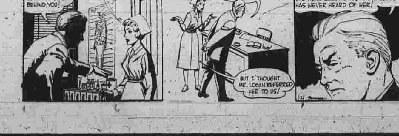
THE STORY OF MARTHA WAYNE